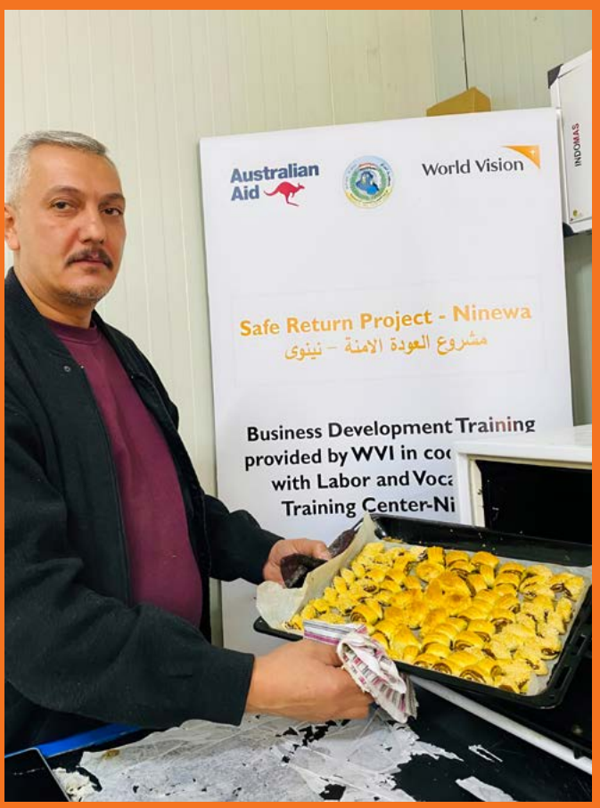
A participant in Safe Returns' bakery vocational training is displaying his pastries. As well as practical skills, the project equips small business owners and entrepreneurs with training in business management, marketing and financial literacy.

A key area of achievement at mid-term was in gender inclusivity and social cohesion. Across the project's high proportion of female participants, women reported far greater freedom of movement to take part in project activities and greater awareness of the available conflict resolution services