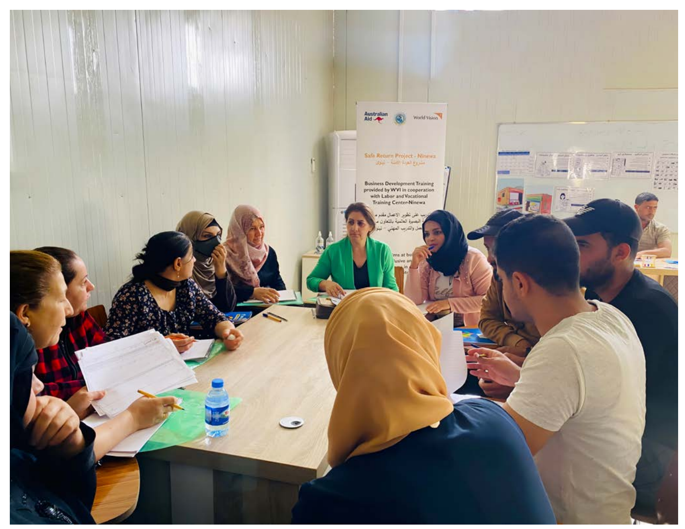
A savings group formed through Safe Returns is meeting to discuss their collective progress and goals. These groups provide members with both financial and social support.

This approach promotes systemic changes that enable local markets to include poor and marginalised households while strengthening their productive capacities. Through iMSD, vulnerable households acquire marketable skills and resources which can be leveraged to provide effective and sustainable solutions to poverty. Support is tailored to the target group's level of market readiness and context.