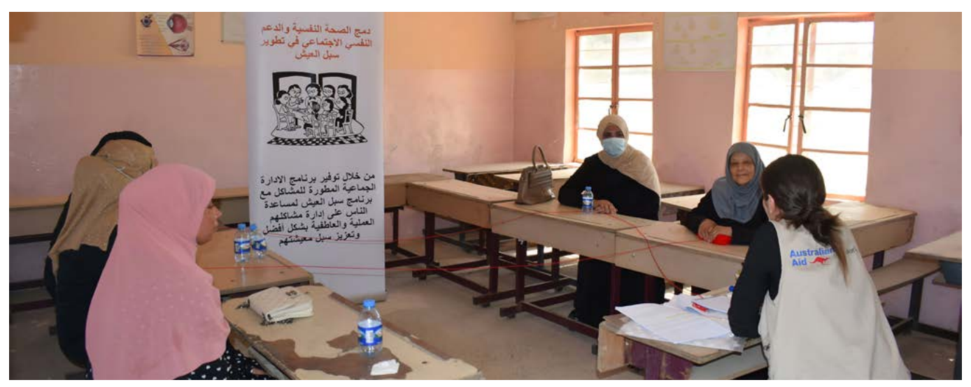
A group of women participants are taking part in a Group Problem Management Plus session which provides psychosocial support to those affected by stress, loss and trauma.

In terms of advocacy and inclusion efforts, Safe Returns has partnered with local disability organisation Sheyaw to develop a gender and disability advocacy plan. This was developed in close collaboration with women, people with disabilities, and their local representatives' institutions. The advocacy plan aims to enhance the inclusion of women and people with disabilities in community and market opportunities as well as increase accessible services for them. The plan has been shared with the relevant local civil society actors such as government officials and local companies who will support its implementation.