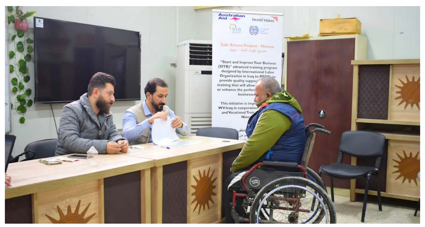
Inclusive business development training for small business owners and entrepreneurs is providing project participants with livelihood opportunities to build their resilience and economic participation.

Additionally, the method of identifying participants with disabilities used in the baseline study (Washington Group Questions<sup>8</sup>) differed from the method used in project monitoring data. This variance limited the mid-term review's ability to precisely compare data on disability inclusion.