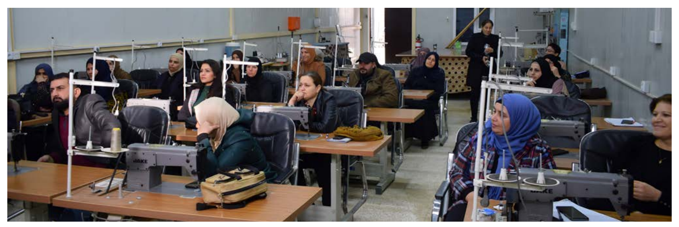
Women small business owners are attending training through Safe Returns. The project has prioritised supporting women and their participation in local markets and economic activities.